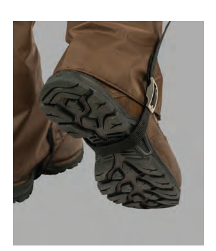
Adjustable Bottom Strap