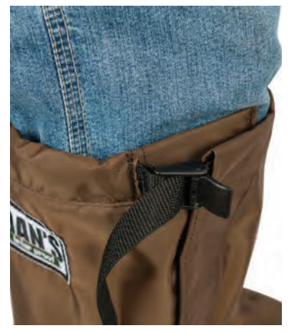
Adjustable Top Buckle