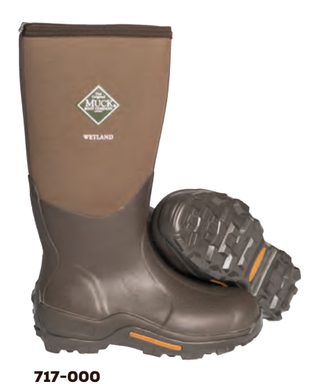
MUCK WETLAND BOOT